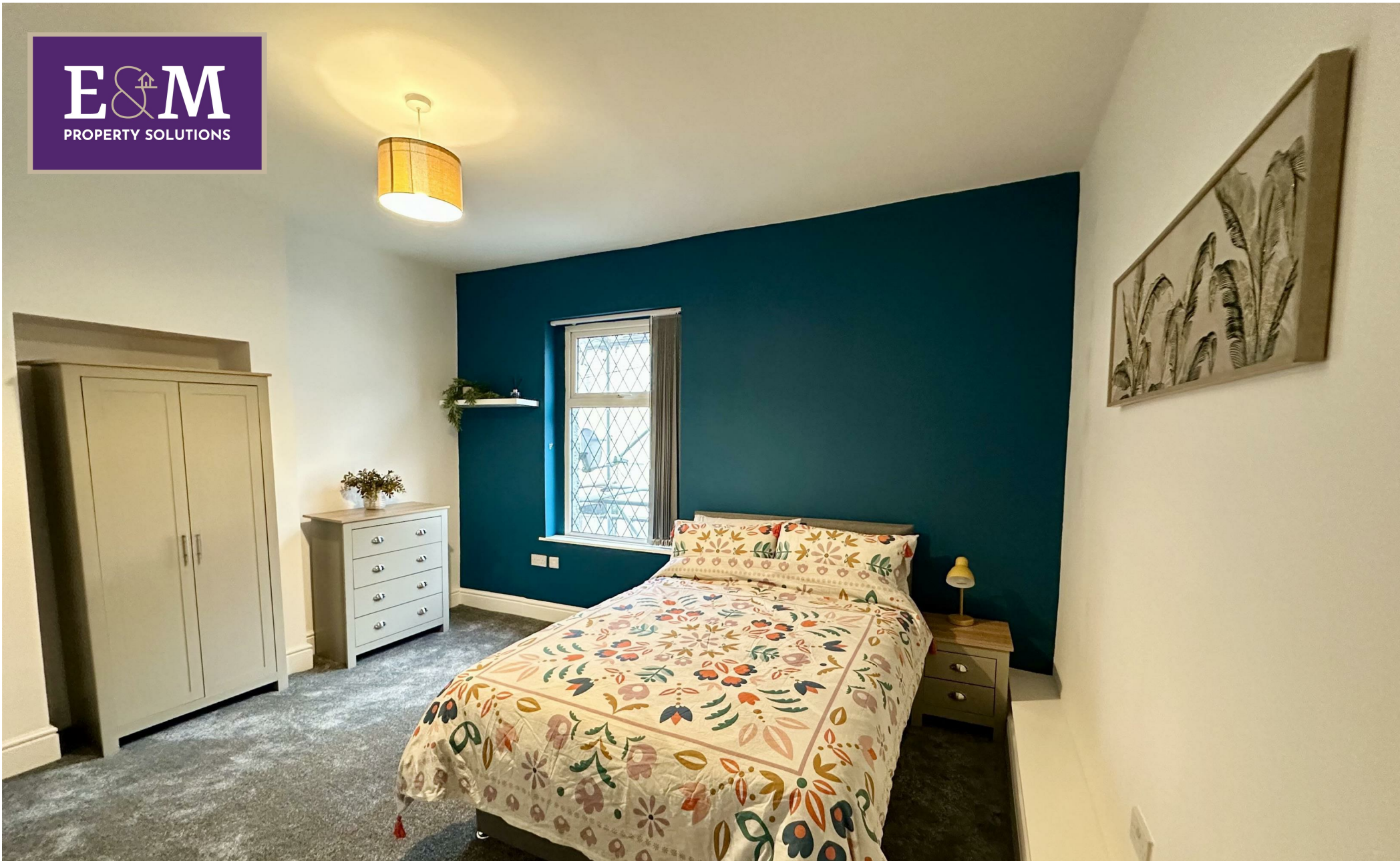
Room 4, 40 Berry Street, Burnley, Lancashire, BB11 2LG £120 Per week